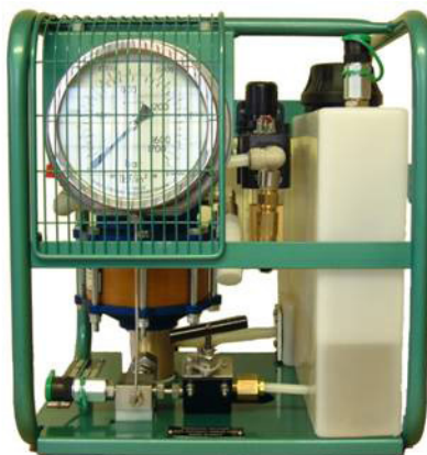
Air Driven Power Pack