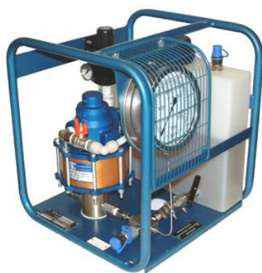
Air Driven Power Pack