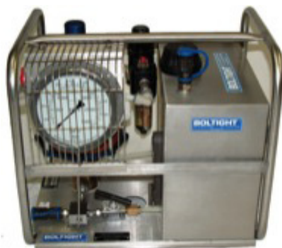
The subsea version of Boltight's Air Driven Power Pack (High Delivery) for operating subsea tooling offshore.