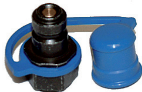
Self sealing quick connect nipple with blue plastic dust cap

Minimum burst pressure is 4500 bar and the minimum bend radius is 150 mm. The hose length is 5 metres. This hose assembly conforms to the European Pressure Equipment Directive and is CE Marked.