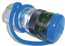
Self sealing quick connect coupling with blue plastic dust cap