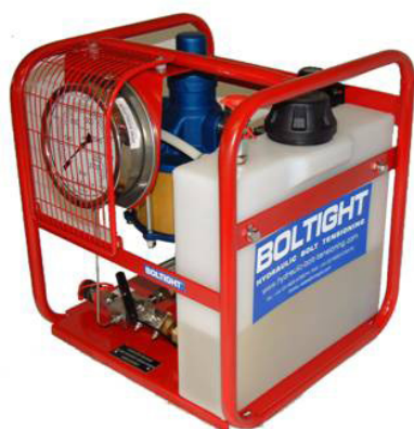
Air Driven Power Pack