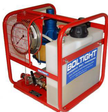
Air Driven Power Pack