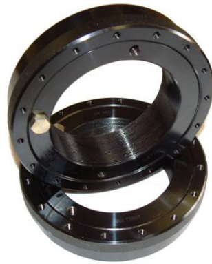
M125 threaded bore load cells. Top entry hydraulic connection. Locking collars to retain load. 700 bar max pressure.

At Boltight we design and manufacture load cells to suit your application. The load cells are designed to work at either 700 bar, 1000 bar, 1500 bar, 2000 bar or 2500 bar oil pressure. Boltight supplies all of the ancillary equipment, such as flexible hoses, quick disconnect couplings and hand or air driven hydraulic pumps necessary to operate the load cells.