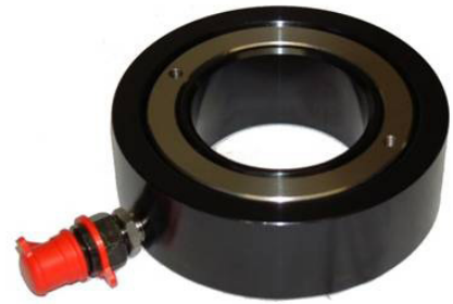
M76 plain bore load cell. Side entry hydraulic connection. 2500 bar max pressure.

Boltight load cells conform to the requirements of the European Pressure Equipment Directive and are CE Marked where called for by the directive. A comprehensive Health & Safety Operating and Instruction Manual accompanies all Boltight load cells, giving easy to follow step by step instruction in the safe use of the product.