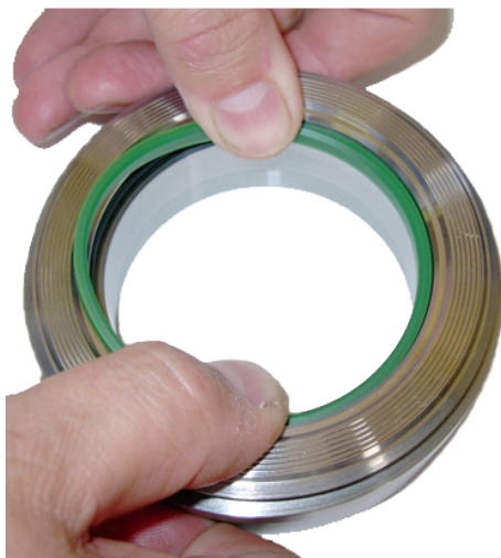
A typical Boltight piston fitted with a composite seal.