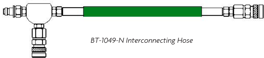
BT-1049-N Interconnecting Hose