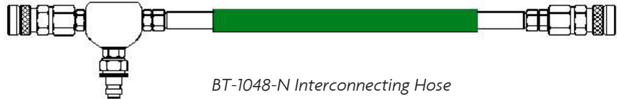
BT-1048-N Interconnecting Hose