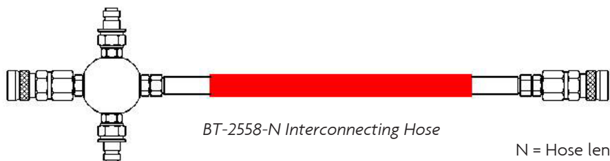
BT-2558-N Interconnecting Hose