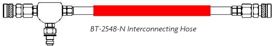
BT-2548-N Interconnecting Hose