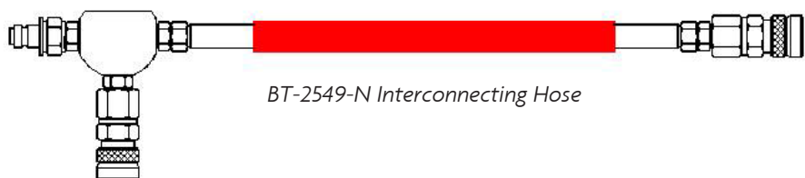
BT-2549-N Interconnecting Hose